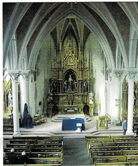
The handsome gothic interior of St. Michael's Church